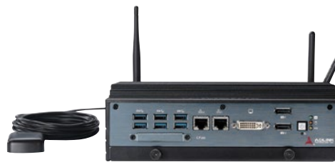
MXE-5400 with Antenna