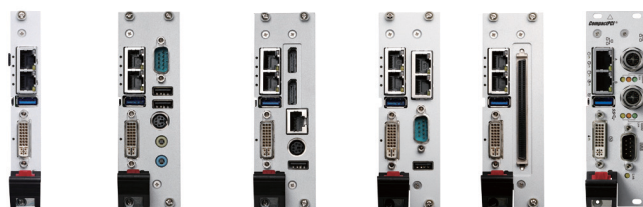
cPCI-3510(BL) cPCI-3510(BL)D cPCI-3510(BL)G cPCI-3510L cPCI-3510M cPCI-3510T