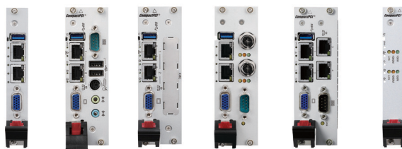
cPCI-3620 cPCI-3620D cPCI-3620S cPCI-3620T cPCI-3620TR cPCI-3620N